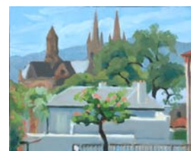
Coralie Armstrong Morning, St Peters Cathedral